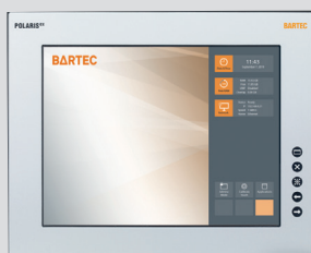
POLARIS Remote ZeroClient 19.1"