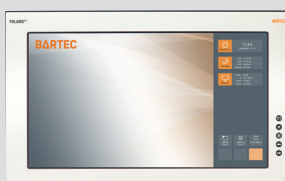
POLARIS Remote ZeroClient 17.3" W