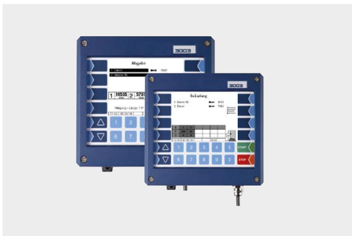
PETRO 3003 Safe/Spds

Modular system solution with integrated data communication