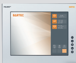
POLARIS Remote ZeroClient 15"