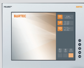
POLARIS Remote ZeroClient 19.1"