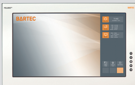
POLARIS Remote ZeroClient 24" W