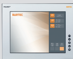
POLARIS Remote ZeroClient 15" Sunlight